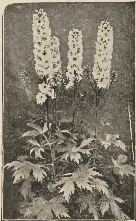
Delphinium Blackmore and Langdon